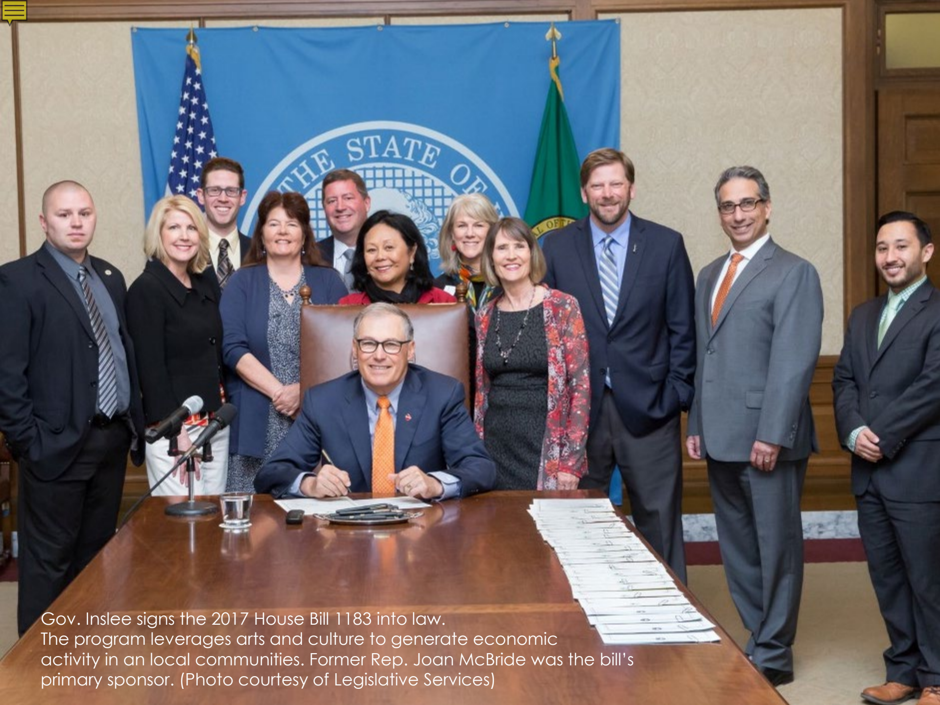
Gov. Inslee signs the 2017 House Bill 1183 into law. The program leverages arts and culture to generate economic activity in an local communities. Former Rep. Joan McBride was the bill's primary sponsor.