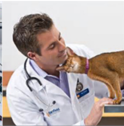
RELOCATE Banfield Pet Hospital