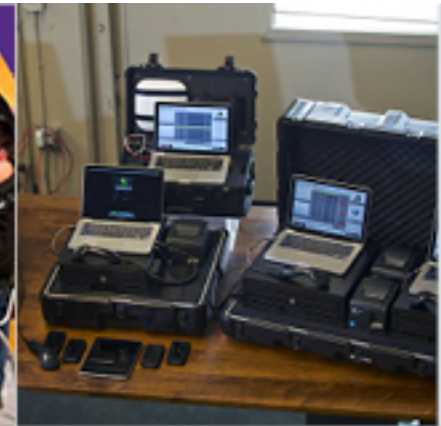
START UP ShopBox