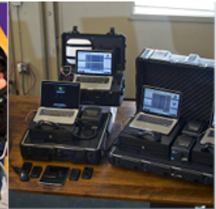
START UP ShopBox